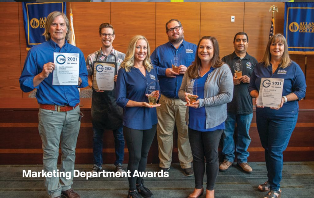
Marketing Department Awards

The college's Public Affairs and Communications department and Campus Graphics department took home seven awards from the statewide Community College Public Relations Organization (CCPRO) for their work promoting the college, many having to do with the college's centennial celebration.