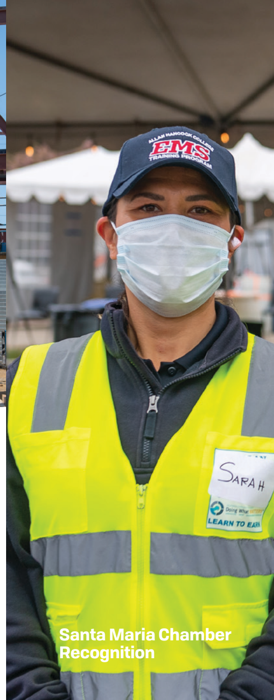
Santa Maria Chamber Recognition