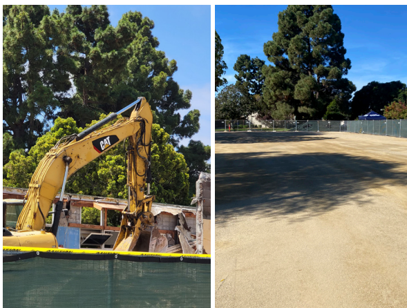
Buildings E & F during and after demolition.