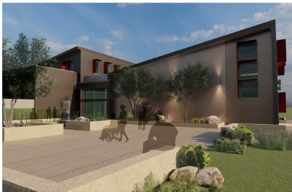
PCPA Stagecraft renderings