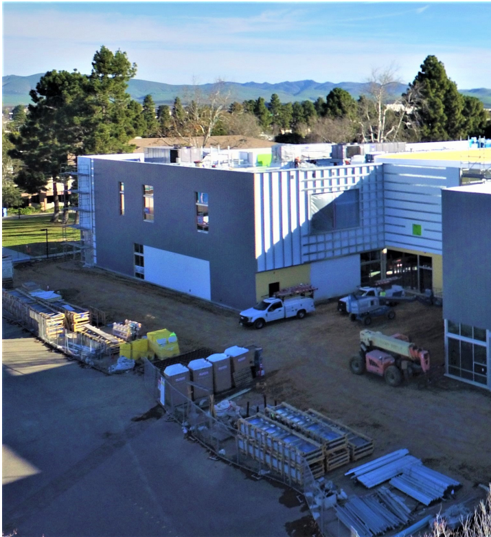
Fine Arts Complex is under construction