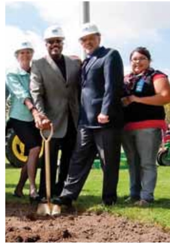
Student Services Center groundbreaking ceremony

A transition was made from Steinberg Architects to BFGC-IBI Group Architecture Planning for the development of the Final Project Proposal for the Industrial Technology project.