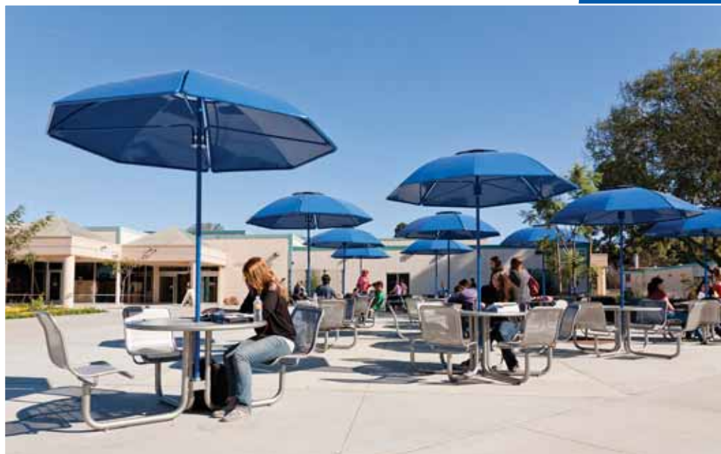
The newly designed Santa Maria Campus Commons

The Citizens' Oversight Committee has reviewed expenditures and projects and finds the district is in compliance with the requirements of Article XIII A, Section 1 (b) (3) of the California Constitution and consistent with the district's approved Measure I local bond measure.