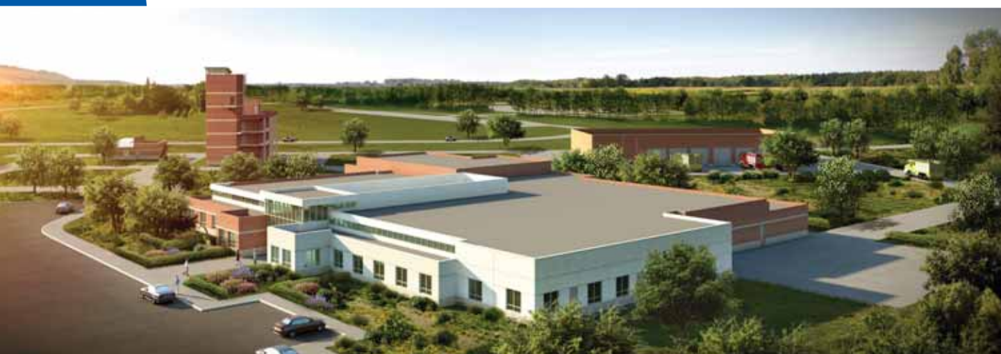
Architect's rendering: Public Safety Training Complex

Steinberg Architects and the Vice President, Facilities and Operations, met with the Division of the State Architect (DSA) to review the Fine Arts Complex and establish the plan check submittal timeline.