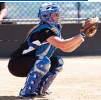
Women's softball, athletics field

The board approved the recommendation to develop the Theatre Arts Complex as a bid alternate to the Fine Arts Complex, which will include minimal remodeling to buildings E and F, and developing a stand-alone structure to the Fine Arts Complex.