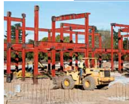
Student Services Center construction

A special board workshop was held on August 27, 2010, where Steinberg Architects presented the option of developing the Theatre Arts Complex as a bid alternate to the Fine Arts Complex. Three options were presented that would minimize the secondary effects the Industrial Technology project would have on the physical education/athletics program and their playfields. A presentation was made providing approaches for funding the Physical Education/Athletics, Remodel Building N project.