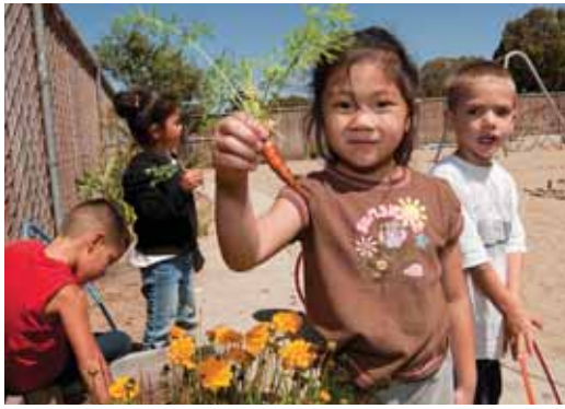
Children's Center Lab