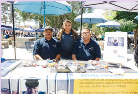
Beyond Incarceration Greater Education